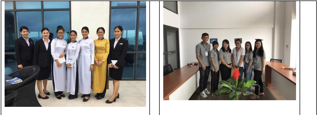
เตรียมความพร้อมก่อนการฝึกประสบการณ์ ณ มหาวิทยาลัย FPT